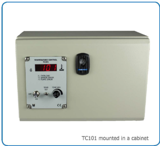
TC101 mounted in a cabinet