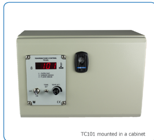
TC101 mounted in a cabinet